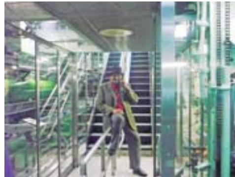
Inside the historic nuclear submarine

New York, like the World Trade Visitor Center, the changed view from the Empire State Building, a visit to the United Nations and the historic ship NAUTILUS,