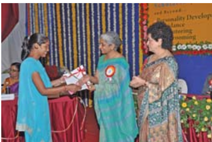
Chief Guest Mrs. Usha Thorat presenting the award certificate to an awardee

When Mrs. Thorat started her career she did not have many options. She mentioned that today there are not just many career options, but also many opportunities to fund the education of one's choice. Speaking about RBIs initiative of inclusive banking, she said, "Women are good borrowers and have a strong sense of duty towards family. In Bangladesh, Mohammad Yunus introduced the concept of self-help groups and look how self-help groups in Bangladesh prospered by borrowing! Today in India self help groups have become a nationwide initiative. Women use money in a better way. It is observed that those poor women are most bankable as they have a tendency to save or keep money aside for their kids and family. Movements like