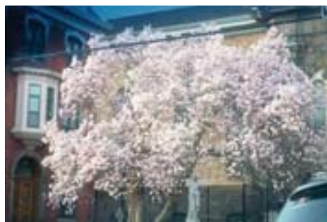
Cherry blossoms in full bloom!

We did spend some time to see some of the new developments in