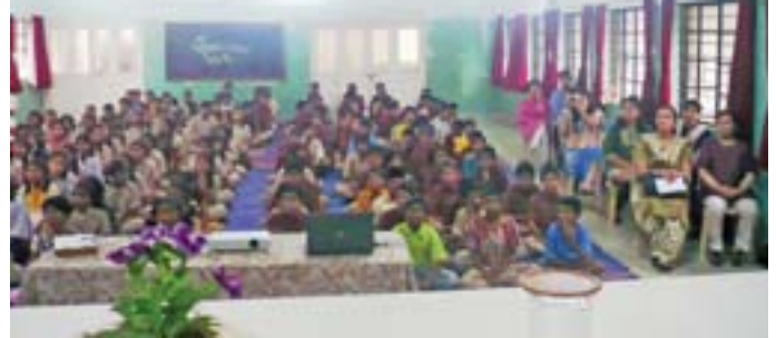
Inaugural ceremony of Project Abhigyan