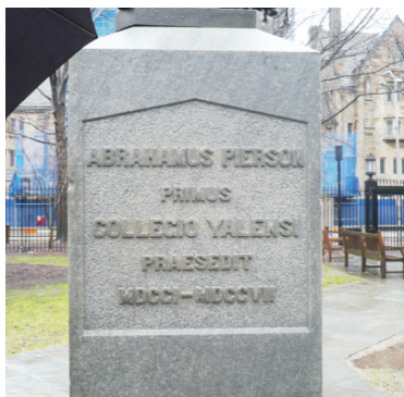
Visit to Yale University

The highlight of our visit to the USA was to meet many Lila Fellows in the BIG APPLE-New York. We invited them for lunch with their spouses and children. One of them even brought her mother who was visiting her. They had all traveled from as far as Cincinnati, Boston, New Jersey, Washington and other surrounding areas. We had all