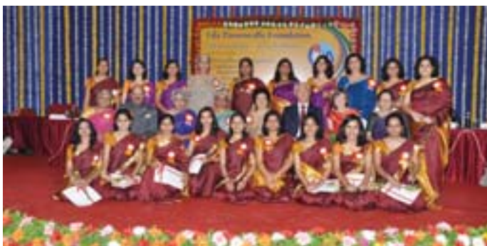
Batch of PA-2010 with Trustees and distinguished guests

also asked them to recognize and understand the importance of saving for the future. He added, "Educational support to the girls should be given at a very early stage. LPF has taken a step towards this by funding undergraduate education starting this year. Lila Girls should develop confidence and ability with a humble attitude and be successful, working for their family and their country. Be a part of the global family. Use your talent for the development of the world. LPF has given an opportunity to many girls for great achievements. I wish you all the best and wish the Foundation all the best for the new project of giving scholarships to undergraduates" .