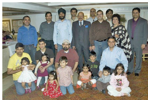
It was a delight connecting with the spouses and children of our LF daughters!