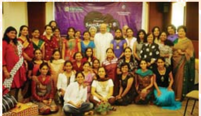
Thanks-giving Party for the team of Samagam-2 at Residency Club