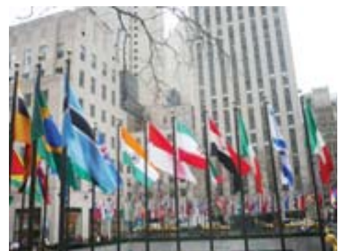
Visit to Rockefeller Center

We did spend some time to see some of the new developments in