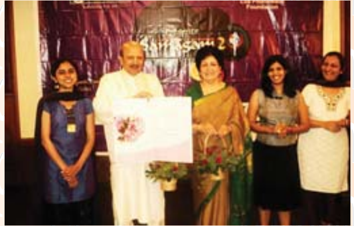
LFs present a gift to 'Dad' on account of Father's Day