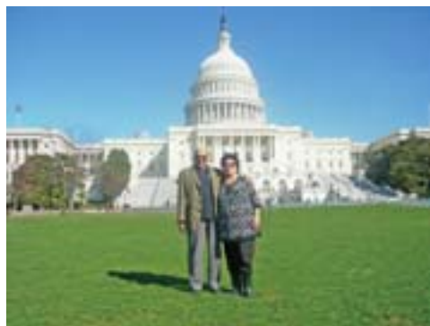
Visit to Capitol Hill, Washington