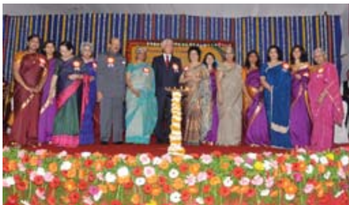
Trustees and the distinguished guests inaugurate the function by lighting the lamp