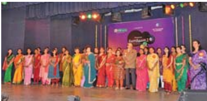
The team of Samagam-2