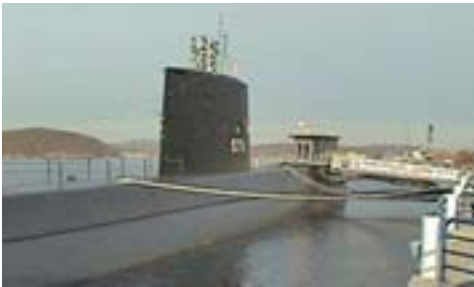
USS Nautilus is a National Historic Landmark and Connecticut's State Ship (Pic downloaded from the website)

assembled in a special hall of the hotel, 'Jewel of India', a signature Indian restaurant in NY. The LFs started pouring in at 11 am and did not want to leave. We were almost driven out by the restaurant management because they had to start preparing for dinner. What an experience- bountiful of joy, happiness, love, laughter, friendship and an opportunity to bond! The girls were enthusiastic in sharing with us their experiences in the US and their changed life style away from their protected one at home. Every one